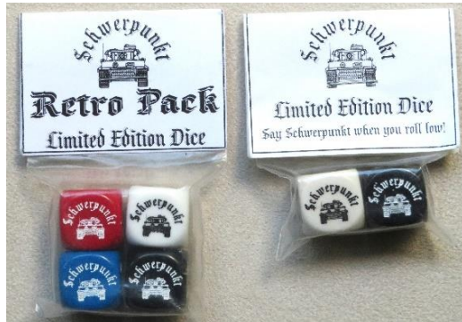
Retro Pack, 4 dice