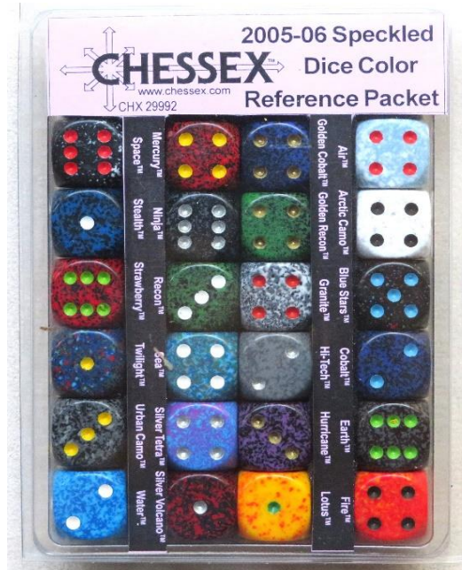
Chessex 29992 Speckled Dice Color Reference Packet