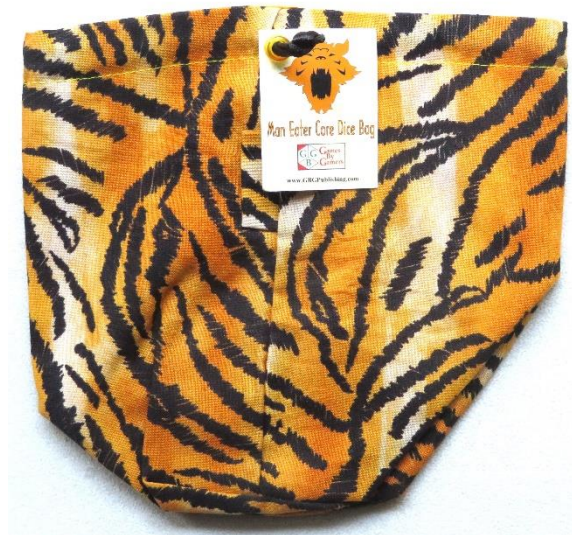
Man Eater Core Dice Bag