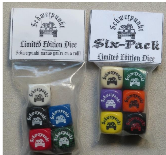
Limited Edition, 5 dice