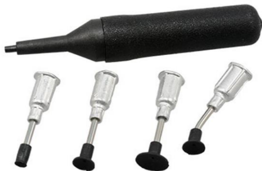
Vacuum Handling Tool Kit