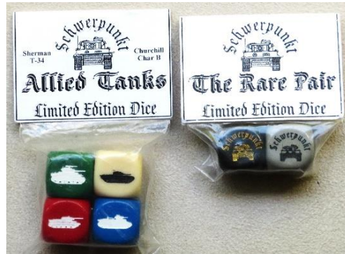
Allied Tanks, 4 dice